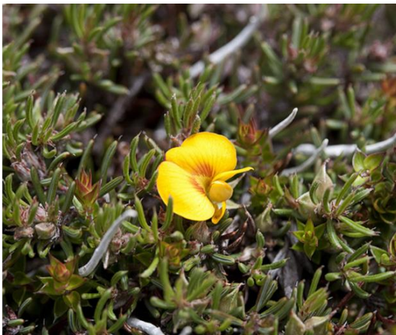
Alpine Bush-pea.