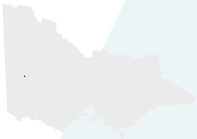
Arapiles Mint-bush Victorian Biodiversity Atlas (VBA) records since 1970. See NatureKit for an interactive map.