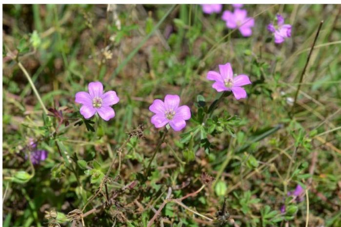
Austral Crane's-bill.