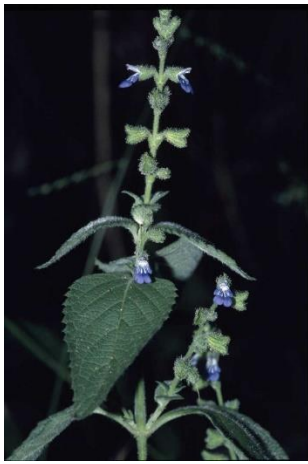
Austral Sage.