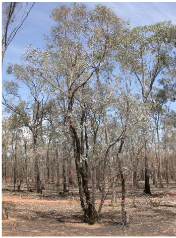
Bealiba Ironbark.