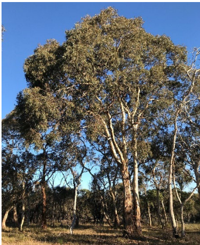
Bellarine Yellow-gum.