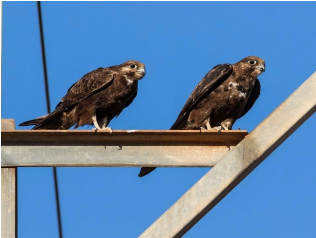
Black Falcon.