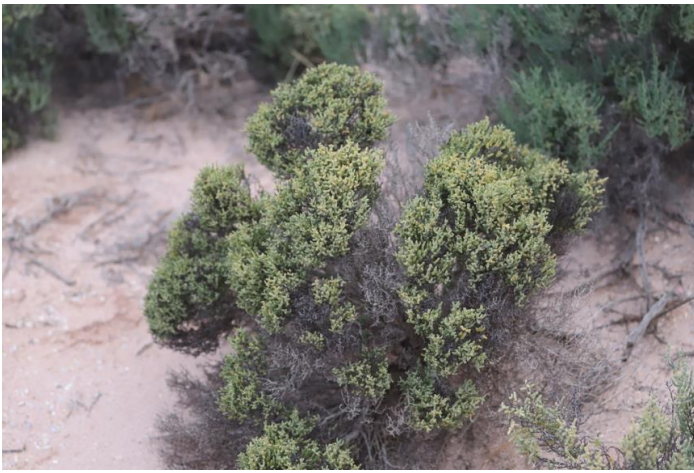
Blackseed Glasswort.