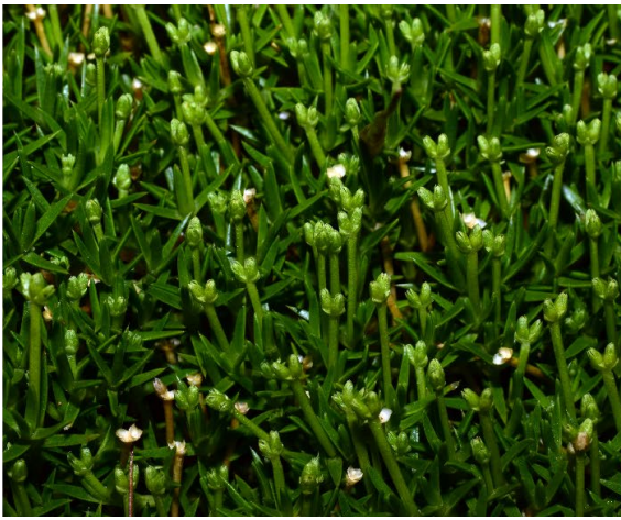
Brock Knawel.