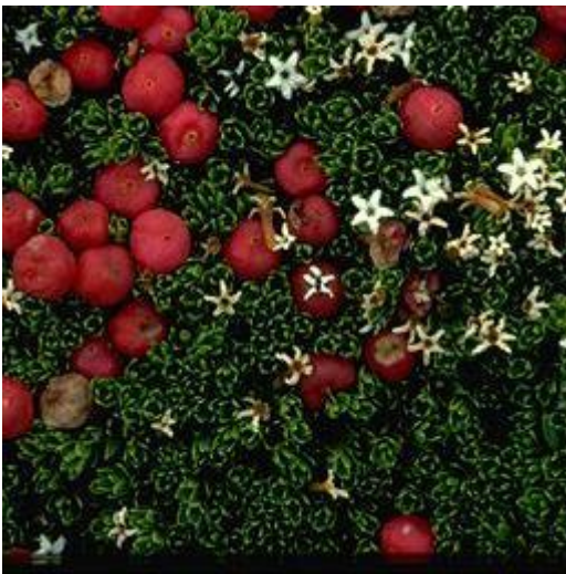
Carpet Heath. Image by Atlas of Living Australia.