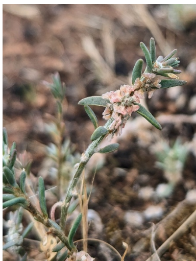
Chariot Wheels.