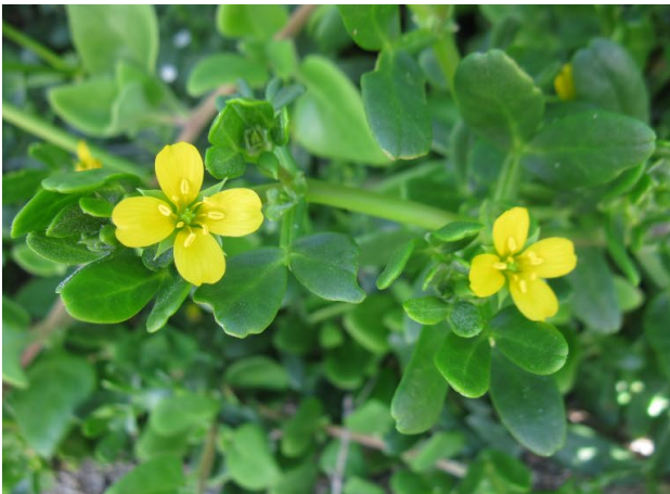
Coast Twin-leaf.