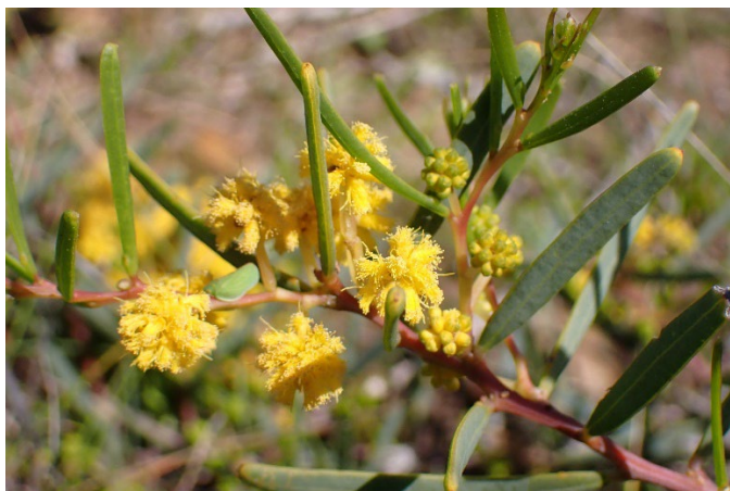
Cup Wattle.