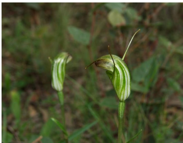
Long-tongue Summer-greenhood.