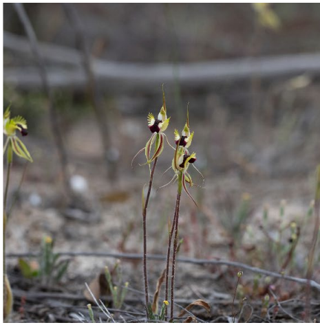
Upright Spider-orchid.