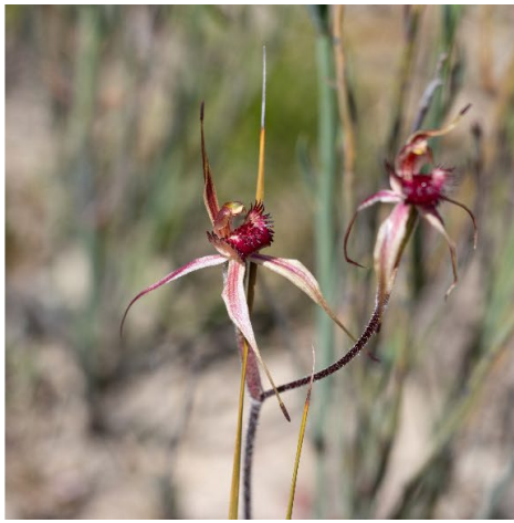
Veined Spider-orchid.