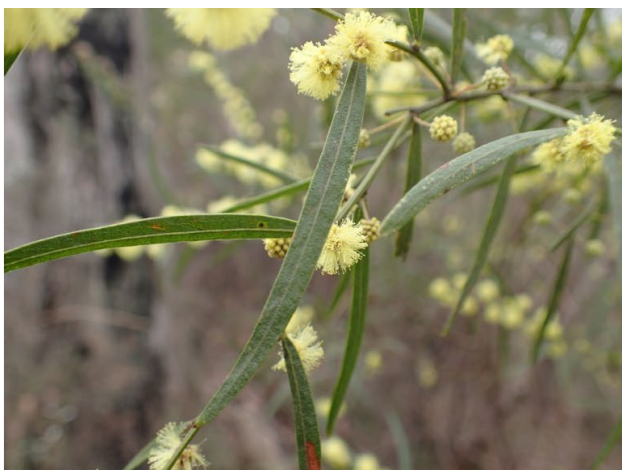
Dandenong Wattle.