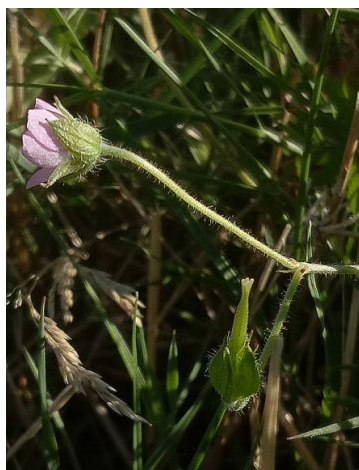
Delicate Crane's-bill.