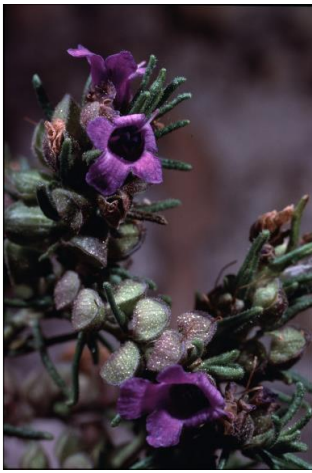
Dense Mint-bush.