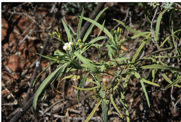
Desert Jasmine.