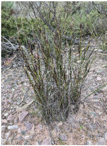
Donkey Saw-sedge.