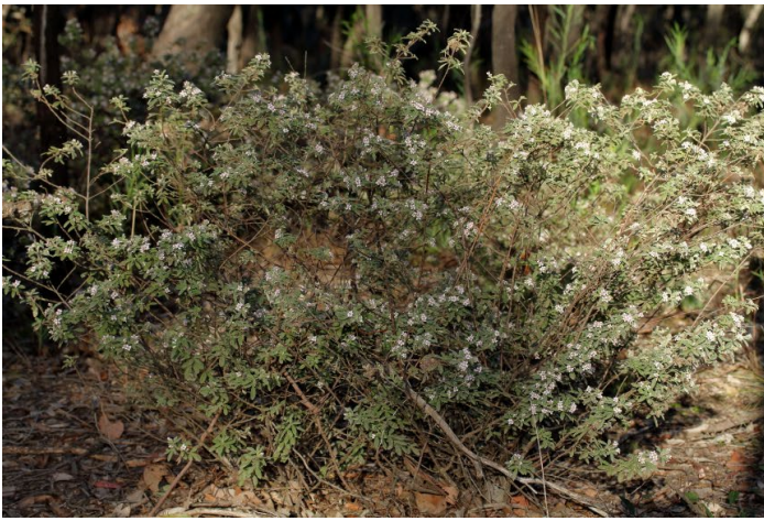
Downy Zieria.