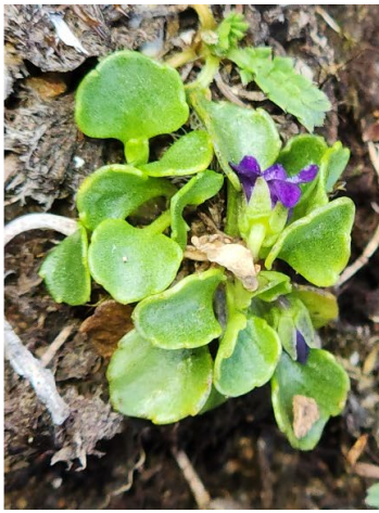
Dusky Violet.