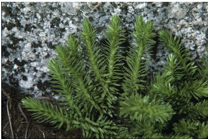
Fir Clubmoss.