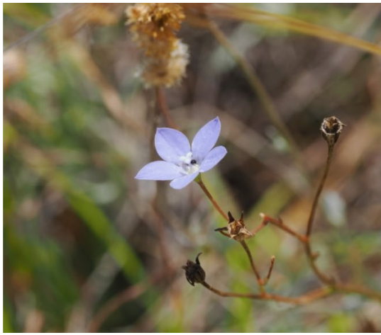
Flat Bluebell.