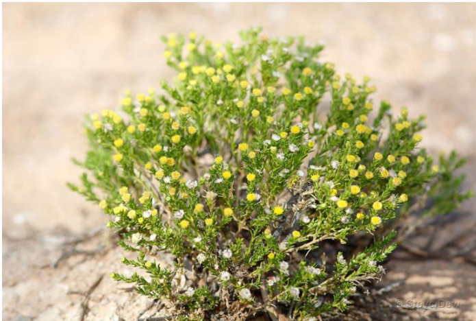
Fleshy Minuria.