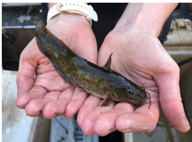
Freshwater Catfish.