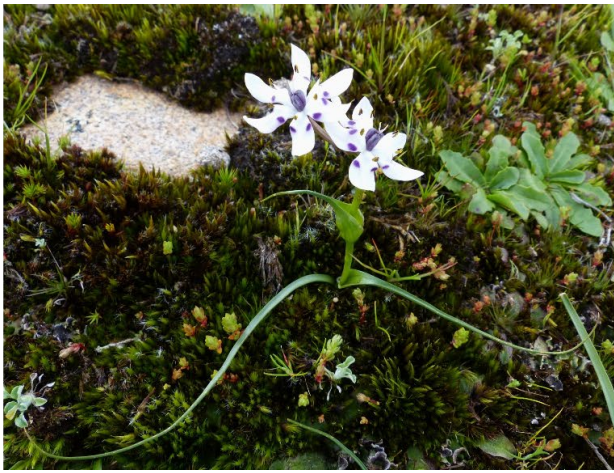
Glandular Early Nancy.