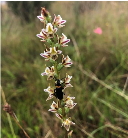
Gorae Leek-orchid.