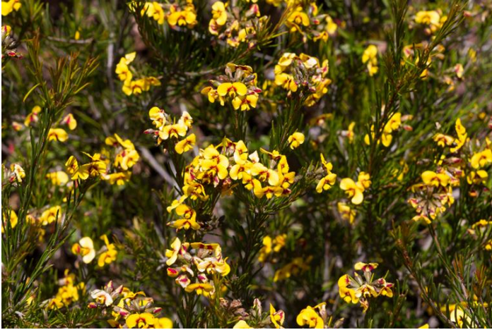
Grampians Parrot-pea.