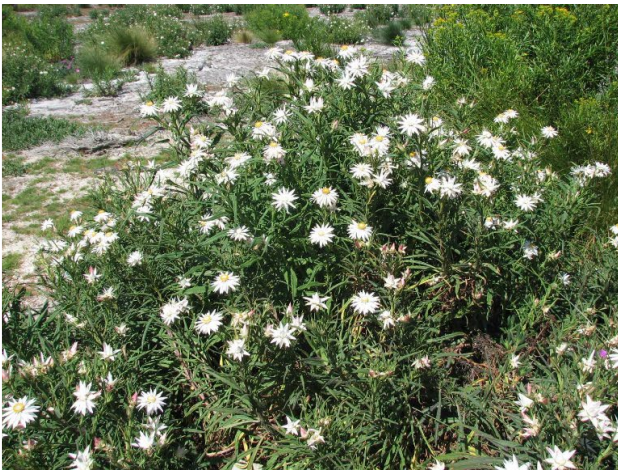
Island Everlasting.