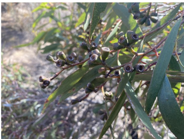
Kamarooka Mallee.