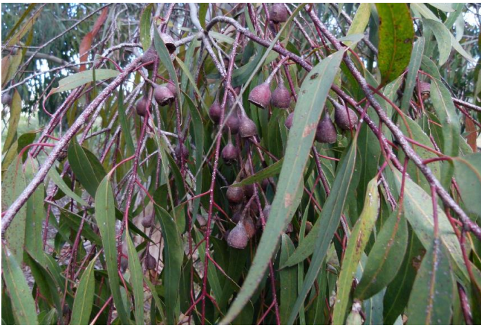
Large-fruit Yellow-gum.