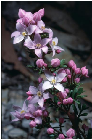
Lemon Boronia.