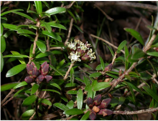
Lilac Berry.