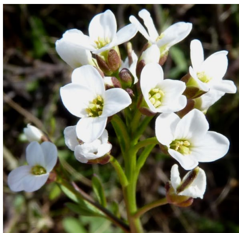
Lilac Bitter-cress.