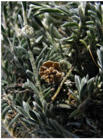
Lobed Bluebush.