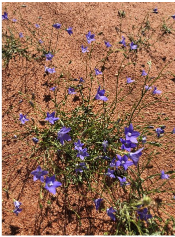
Mallee Annual-bluebell.