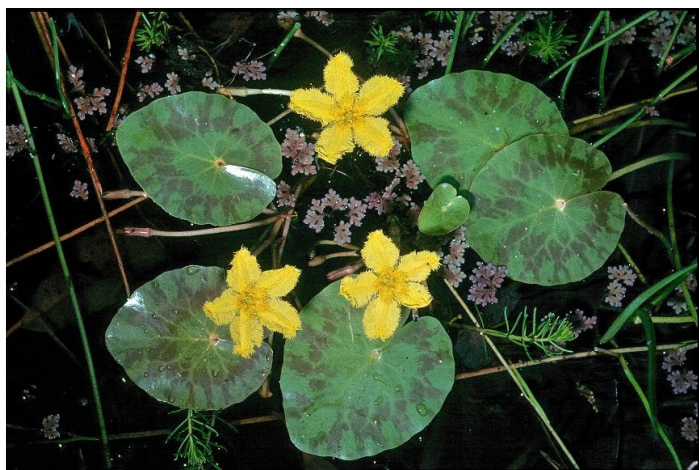
Marbled Marshwort.