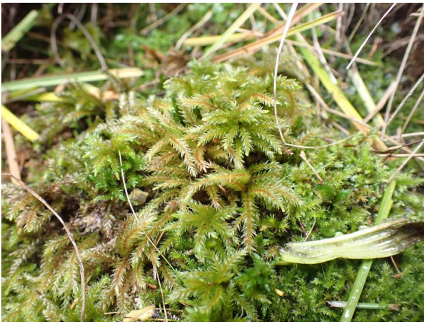
Marsh Tree-moss.