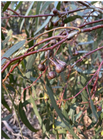
Melbourne Yellow-gum.