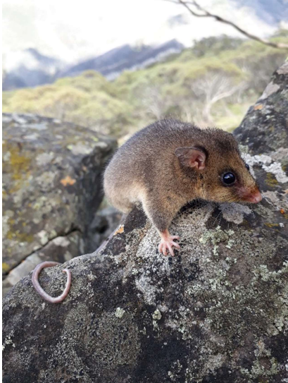
Figure 1: A Mountain Pygmy-possum in the Mt Hotham boulder fields.

The Mountain Pygmy-possum Burramys parvus (Broom 1896), is the largest of five species of pygmy-possum in Australia. The Mountain Pygmy-possum has grey-brown fur on the head, back and sides with pale grey-brown to cream underside. The tail is scaly, sparsely haired, prehensile and longer than the head and body combined. It can weigh between 35g and 80g (Menkhorst and Knight 2011).