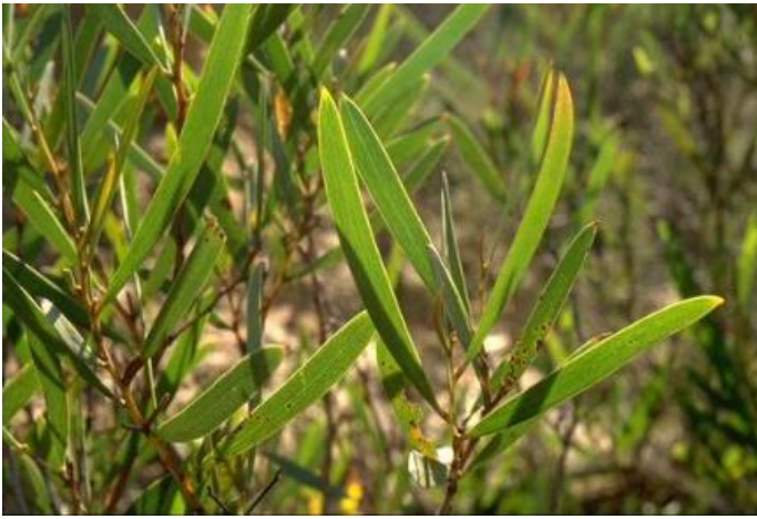
Net-veined Wattle.