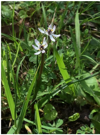
One-flower Early Nancy.