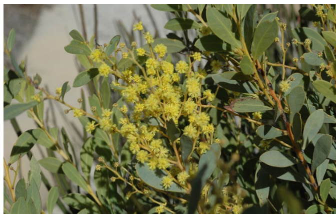
Pale Hickory-wattle.