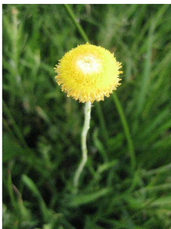
Pale Swamp Everlasting.