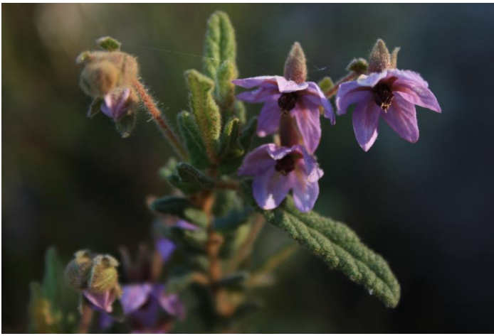
Paper Flower. Image by Geoff Lay.