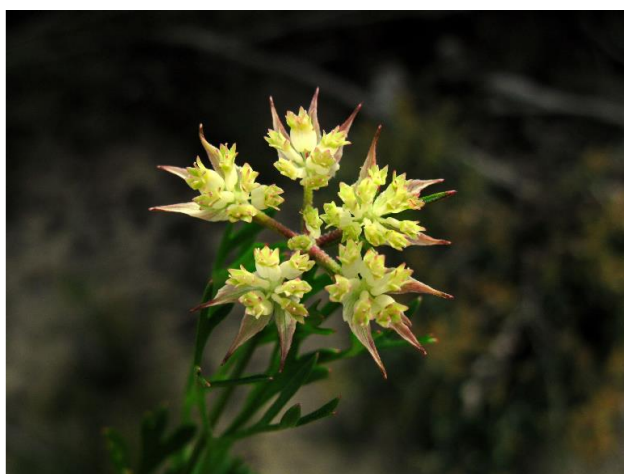
Parsley Xanthosia.