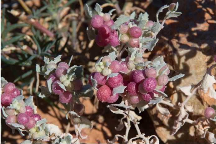
Pop Saltbush.