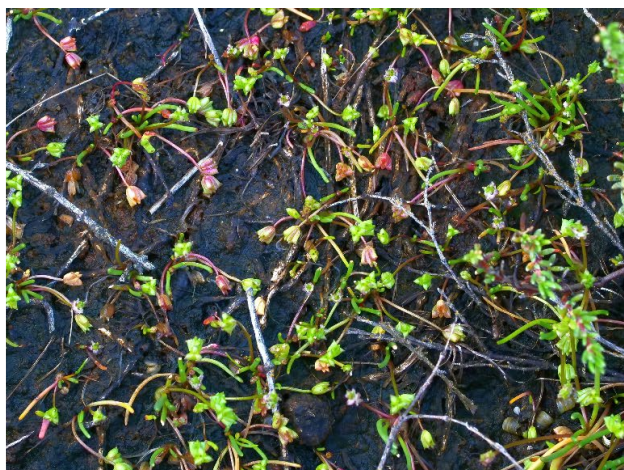
Prickly Arrowgrass.